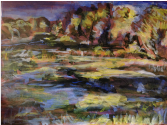
Heron Pond - first glazing. To be continued....

On June 8 , a small group of artists met at Heron Marsh and spent four hours attempting to capture the colors and the light of the vanishing pond and surrounding woods. A family of Canada Geese also came by to add to the idyllic scene