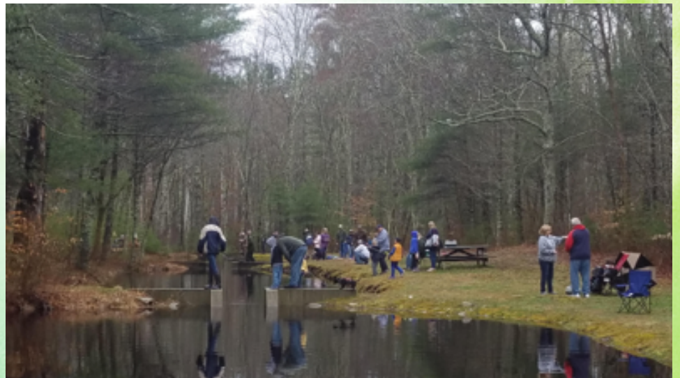
Derby Day

The result was an area in which young and old were able to enjoy the delights of an early spring day in the Forest while the young ones learned a skill that can be of benefit to their future lives. What can be better than catching your own fish and then taking it home and cooking it up for a delicious meal!