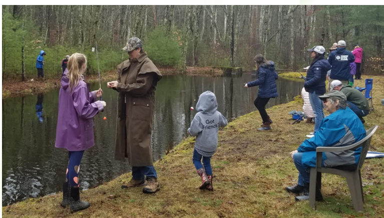
Derby Day